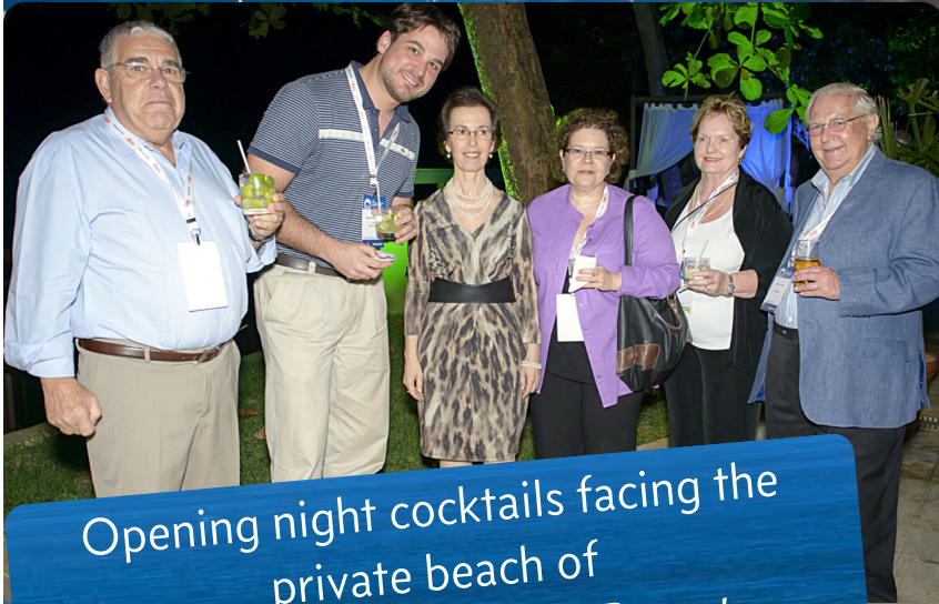
Opening night cocktails facing the private beach of Sheraton Rio Hotel & Resort